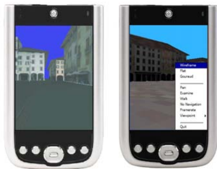
Figure 1: The MobiX3D player [NCB06] displays 3D content (described in the ISO standard X3D) on mobile devices; it can be downloaded from http://hcilab.uniud.it/MobiX3D

Computer graphics has a relevant role in almost every domain of computer applications. It is thus natural to think about bringing it to mobile devices to exploit the power of graphics anytime, anywhere. Unfortunately, limitations of mobile devices make it impossible to follow a trivial porting approach from desktop computers. A considerable research effort is needed to understand how to design and implement effective graphics applications for mobile devices. This invited talk will first discuss in detail the peculiarities of the mobile graphics context that motivate research. Mobile devices have limitations that are not typical of desktop computers and the mobility context is different in many ways from that of traditional computer graphics. The speech will illustrate the differences that have to be taken into account in developing a mobile graphics application. It will also mention issues concerning limited cognitive resources and safety [CD04] of mobile users as an additional motivation to employ mobile graphics effectively as a way to provide information at-a-glance that is easily understood with less cognitive resources and distracts the user as less as possible from her current primary task. Then, we will deal with the different issues of designing a mobile graphics application, especially focusing on the so-called presentation problem [AS01, BR03, BCCR04, BCG06, Chi06, RCSH04] since the limited screen size of mobile devices makes it particularly difficult.