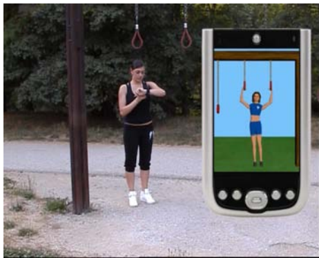
Figure 3: The MOPET system [BCN06] exploits context-aware 3D demonstrations of fitness exercises to train users in outdoor fitness trails.

better understanding her fitness status (e.g., to better plan her training) or a physician in assessing her condition and giving more personalized advice or a professional trainer in comparing the performance of different athletes in a sport team.