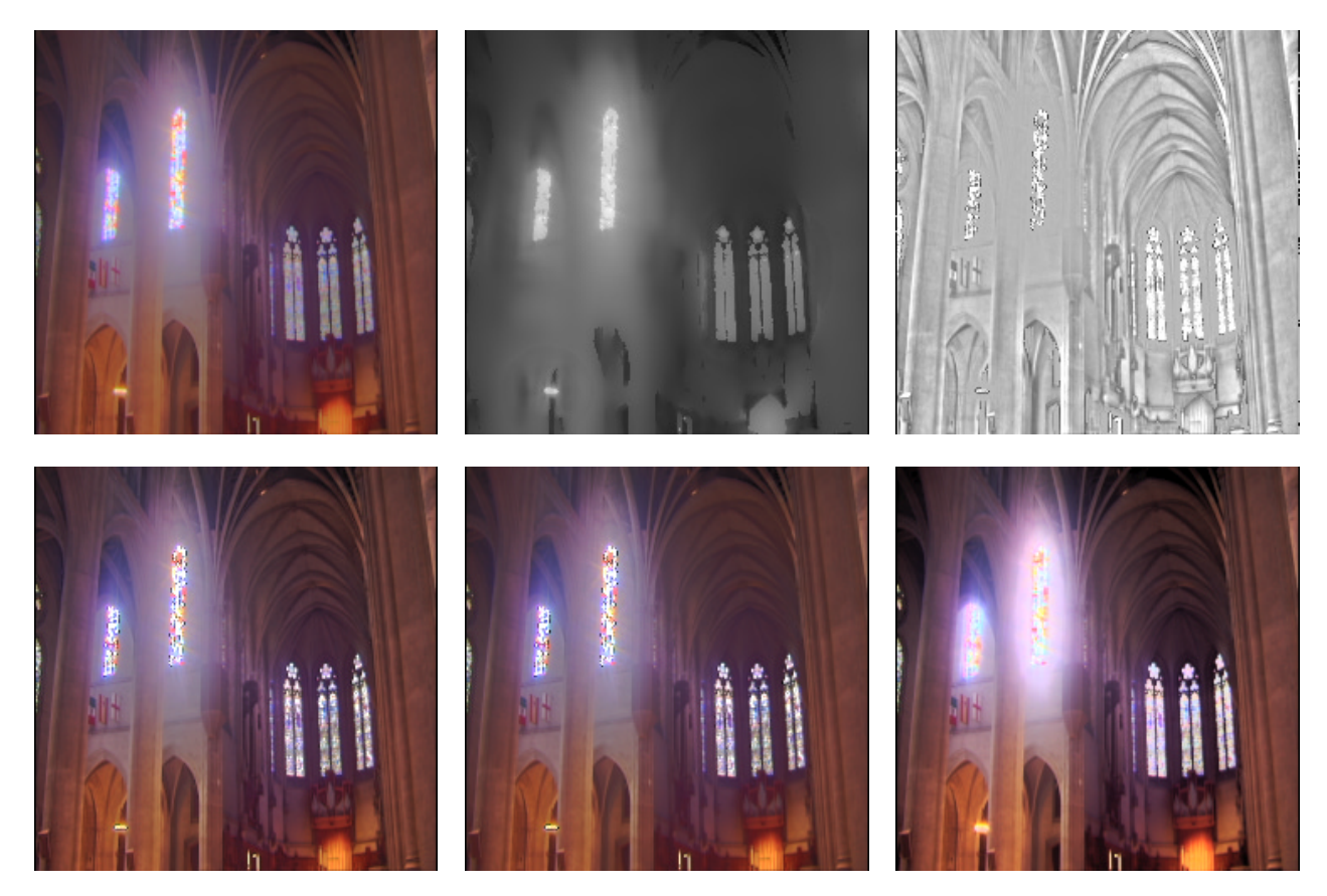
Figure 3: Operation of our algorithm. In reading order: a. application of TM(L) to pixel luminances, b. computed adaptation image after tone mapping by TM, c. details image (midlevel grey corresponds to value one), d. final result using equation 2, e. same using visible contrast definition (equations 3 and 4), f. histogram-based tone mapping <sup>11</sup> result.