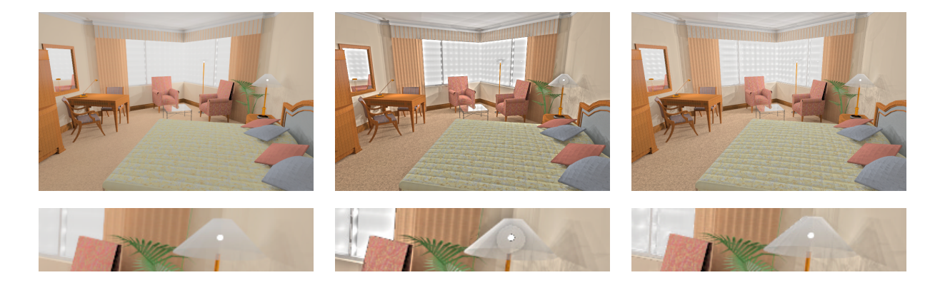
Figure 4: Tone mapping with different restrictions on local contrast |lc(s,x,y)|. Left: TM(L) directly applied to pixel luminances (formally, |lc| < 0) Middle: |lc| < 0.5 - note some artifacts due to halos and false jumps in adaptation level. Right: |lc| < 0.1 - a better overall choice for this image. Corresponding detail views are also shown. Original image is proposed Burswood Hotel Suite Refurbishment. Interior design - the Marsh Partnership, Perth, Australia; computer simulation - Lighting Images, Perth, Australia.