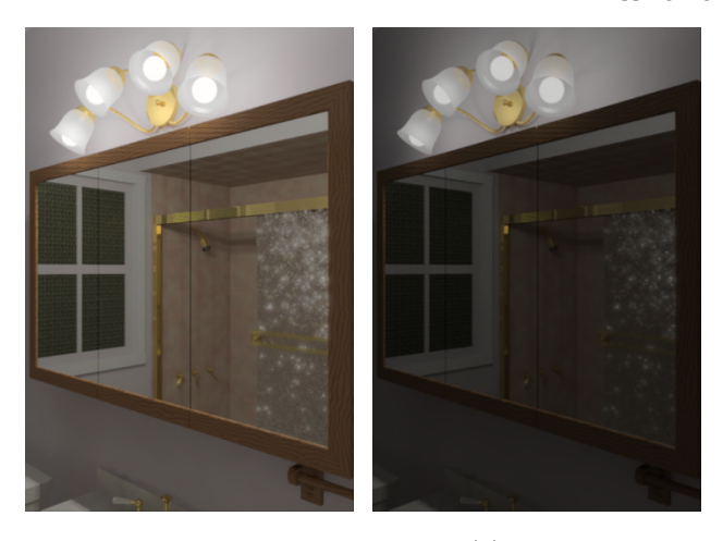
Figure 2: Tone mapping function TM(L) applied directly to pixel luminances. Left: bathroom scene from <sup>11</sup>, right: dimmed to 1/10000 of the original level.

given by the ratio of display to world total luminance capacities comes out to be around 1/2 to 1/3 in agreement with simple practice of taking cubic root of luminance as a tone mapping operation. Our function was constructed with no consideration of preserving image details. On some images, however, applying just this function directly to pixel luminances produces satisfactory results. An example is shown on Figure 2 where we present bathroom scene used in <sup>11</sup> under two different illumination levels to demonstrate the operation of TM(L) alone.