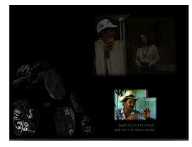
Fig. 1 . Maltez, Bennett and Cova 1997: Interactive Documentary 'Contact'. The user chooses between the main video narrative sequence and supplementary narratives which appears when appropriate in the space. Choosing is done by simply pointing at the item of interest.

There is a need to place multiple elements in a single space to make them accessible to vision and interaction. This can lead to segmented spaces like those of the television news broadcast, using juxtaposition and layering of related elements. The spatial organisation of software applications tools such as Adobe Photoshop offers interface objects in discrete areas. The relationship between them is not articulated, so it is not generally apparent which objects control which until the user becomes accustomed to each application.