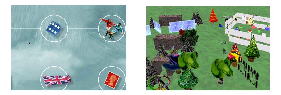
Fig. 2. Examples of 2D and 3D pre-pictorial spaces in Britain in Brief and the VERTEX environment built by young school children Bailey and Moar (2001) in ActiveWorlds.

We define as pre-pictorial those spaces which can usefully be considered to exist independently of any particular view. In the simplest cases such spaces are twodimensional but extend beyond the boundaries of any single view. For example Britain in Brief (Foreign and Commonwealth Office 1997) offers a six-by-five array of iconic pictures based on photographs. Clicking one of the pictures leads to other screens. The user is never permitted to see all thirty pictures at once since only about four fit the display (Fig. 2.) and there is no facility to zoom-out for a broader view (nor, as a Web-user might expect, to alter the frame of the window). This is clearly deliberate, since there would be sufficient space to exhibit thirty such images at a usable size in a single screen.