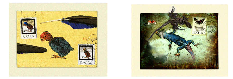
Fig. 6. Mayhew 1997: Ceremony of Innocence. This CD-ROM explores the boundaries between levels of representation.

perceived as in some sense 'natural' and has through custom become almost invisible to the film viewer.