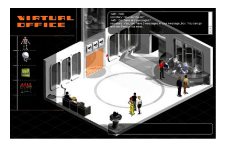
Fig. 3. Chung et al. 2000: Virtual Office, a project visualising a shared virtual work environment. Translucence is used to integrate components with different spatial modes.

Hybrid spaces combine some of the characteristics of simple assembly with those of three-dimensional worlds, reflecting the combined demands of presentation and of interaction. Such juxtaposition of spatial methods might be disconcerting, but in practice for involved users these spatial hybrids have become acceptable, partly through the efforts of designers to disguise incongruities. It is possible that this impression of incongruity is itself a temporary phenomenon arising from the relative unfamiliarity of these spatial configurations, and that in future they will come to be seen as transparent and natural.