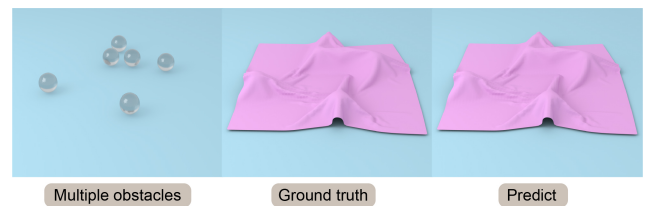
Figure 3: Our method works well on multiple, disjoint obstacles.

error is calculated as depicted in Eq. 12 in the main paper. From the curve, the trend of the errors of our network prediction is lower than TailorNet [PLP20].