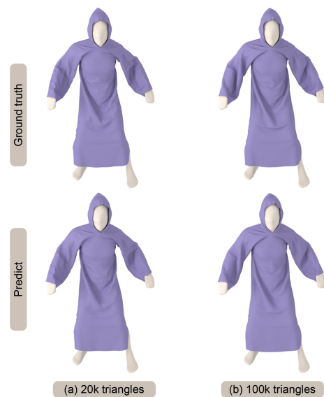
Figure 2: We vary the mesh resolution for a given cloth robe between 20K and 100K triangles. In each case, our predicted cloth mesh is similar to the ground truth.

Figure 4 shows the error curve of our method and the predictions of TailorNet [PLP20] with ground truth on the test frames. The test frames are obtained from the test data split from TailorNet. The