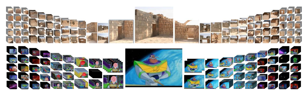
Figure 7: Screenshots of PileBars in action on different datasets. Also refer to the attached videos.