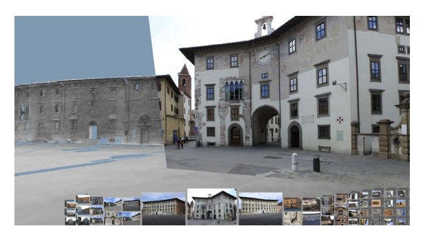
Figure 2: A screenshot of PhotoCloud, an application using PileBars and presenting here the Cavalieri Square dataset. The main area of the screen presents a 3D scene, that the user is able to navigate. Selecting a focus image on the Pile-Bar presented below causes the viewpoint to jump on the corresponding virtual camera location.