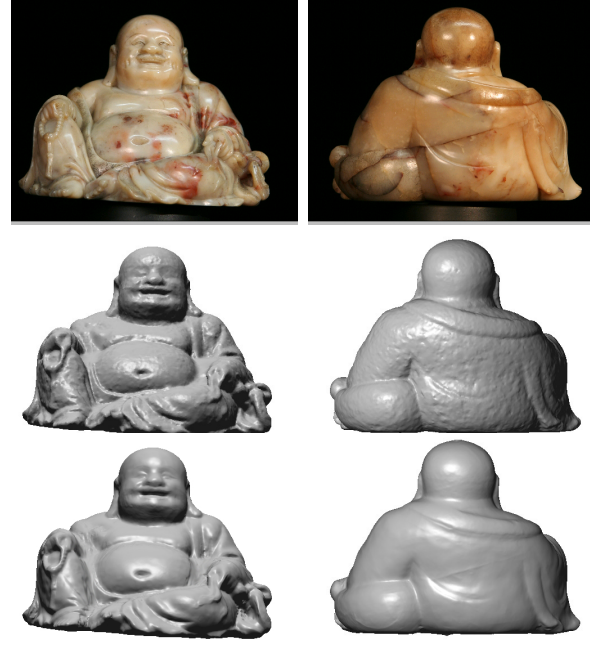
Figure 3: Reconstructing coloured marble. Top: Two input images. Middle: model obtained by multi-view stereo method from [HS04]. Bottom: proposed method. The resulting surface is filtered from noise while new high frequency geometry is revealed (note the reconstructed surface cracks).

[KZ02] KOLMOGOROV V., ZABIH R.: Multi-camera scene re-