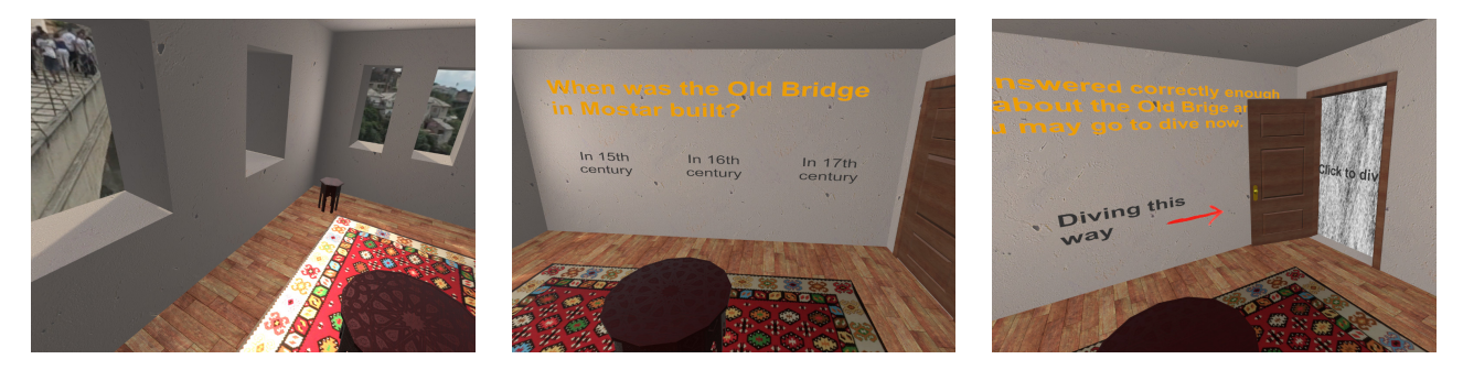
Figure 5: Screenshots of the room where the quiz was taking place. The user could see some traditional Bosnian furniture in the room and the Old Bridge through the windows (left). The first question (middle) - each question was displayed on the left, front or right wall. The direction for progression to the diving component once the quiz participation was successful (right).

E. Selmanović, S. Rizvić, C. Harvey, D. Bošković, V. Hulusić, M. Chahin and S. Šljivo / Intangible Cultural Heritage Preservation