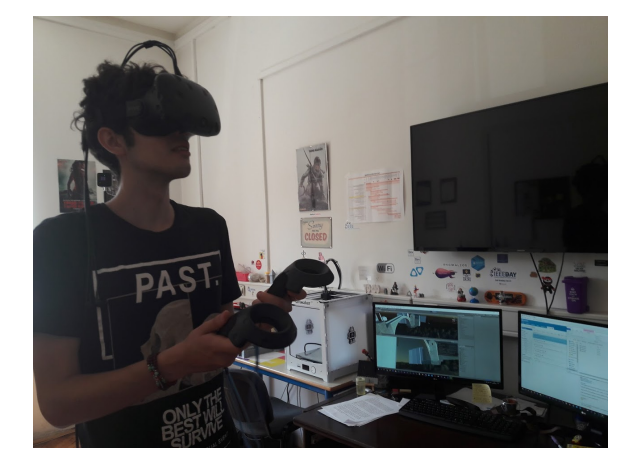
Figure 7: User during the evaluation experiment. A full video highlighting key elements of this experimental process is available online [Sar18a].

E. Selmanović, S. Rizvić, C. Harvey, D. Bošković, V. Hulusić, M. Chahin and S. Šljivo / Intangible Cultural Heritage Preservation