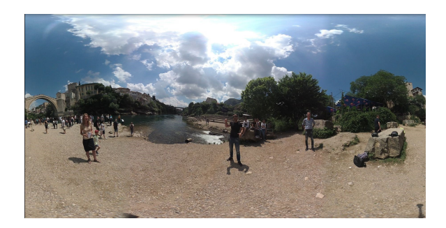
Figure 2: Story about bridge diving - the interview with Lorens Listo, the cliff diving champion

For this project, we have structured the storytelling into five stories. The introduction story offers an overview of the Old Bridge cultural monument, cliff diving tradition and what the users can