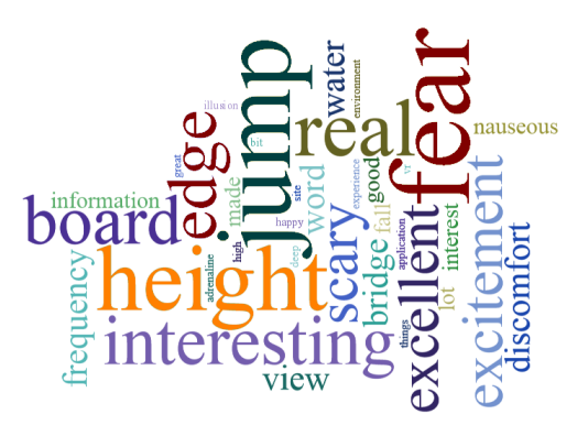
Figure 9: Word cloud illustrating the frequency of words used to describe feelings of being on the top of the diving board.

This suggests that current technologies such as VR can facilitate an empathetic connection with the community and preservation of intangible heritage. The identified themes are relevant for designing a novel evaluation instrument to measure immersion and edutainment. An example of such an instrument is the thematic analysis of answers to the interview Q7. The most frequent themes have been identified as: fear, jump, height, and real. These themes were observed with frequencies from the interview transcripts of 9, 8, 7 and 6, respectively. This is visualised in Figure 9 (right).