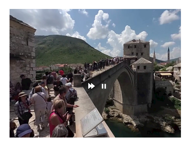
Figure 4: Story controls - left button for skipping the current story and moving to the main menu, and right button to play/pause the story.

VR application. It is desirable to consider routes to improve interaction and subsequent quality attributes such as immersion and edutainment. However, the main purpose of the study was to explore user needs and behaviours, compare their experience and performance (with respect to different levels of preconditioning), and identify strengths and limitations of the approach proposed in the paper.