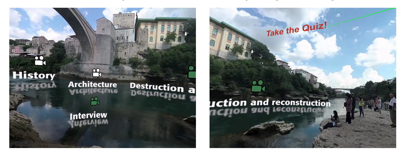
Figure 3: Screenshots of the main menu: the story selection (left) - the green camera button indicates the story has been watched; the quiz button (right) - displayed only once all the stories have been watched.

E. Selmanović, S. Rizvić, C. Harvey, D. Bošković, V. Hulusić, M. Chahin and S. Šljivo / Intangible Cultural Heritage Preservation