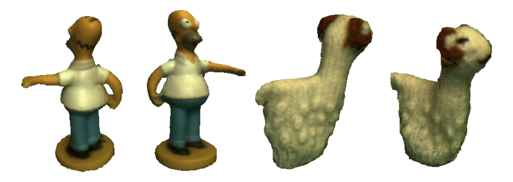
Figure 3: Renderings of captured models of a Homer Simpson figure, and a sheep finger puppet