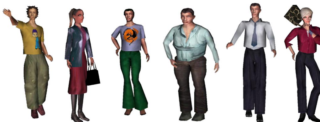
Figure 1: Various avatars help users to express their individuality – either real or wishful

There are two different reasons for using regions. Firstly, a region limits the number of avatars, thus decreasing the network traffic when distributing avatars' activities. It also uniquely assigns a user to certain chat group. The second reason is done by technological limitations – only relatively small 3D scene can be rendered in a real-time and can be transmitted from the server to a client in reasonable time. Thus the virtual worlds have to be structured in regions that are maintained independently.