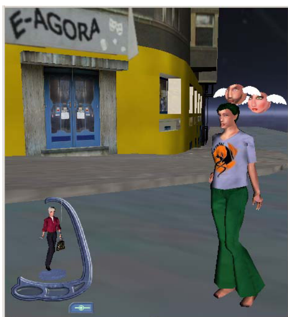
Figure 4: A tutor in e-Agora (the avatar on the right side) and metaphor for dependent navigation of two users. Animated virtual body in the left bottom corner represents an avatar of local observer.

Currently one culture center (Akropolis in Prague) has been modeled. The model consists of several VRML scenes that correspond to enclosed spaces (concert hall, bar, restaurant, etc.). Next, we provide one GV server that maintains tens of interest groups. To reduce network bandwidth requirements, VRML files describing static parts of the model are stored locally. Only changing parts (exhibitions, etc.) are downloaded over the Internet.