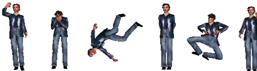
Figure 2: Some gestures – agreement, sadness, excitement, neutrality, happiness, disapproval

The interesting fact is that the Blaxxun system can be directly used for “classical” chat without any 3D information. When users have not enough computational power or network bandwidth for rendering 3D data, they still can join the textual chat in already existing virtual worlds. This approach is used at www.cybertown.com . Text and VR chat co-exist there and the question “ Is VR able to markedly enrich text based social interaction? ” appears again, since many users still prefer text chat, although now-a-days computers are equipped with sufficient software and hardware support for Internet based virtual reality.