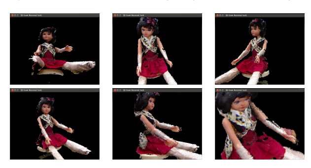
Figure 2: Synthesized views of a on-line 3D reconstructed model dependent of observer point of view.

Figure 2 shows a reconstructed 3D model. It results from several 3D point clouds fused in real time after applying successive 3D rigid body transformations, mesh refining integration and rendering.