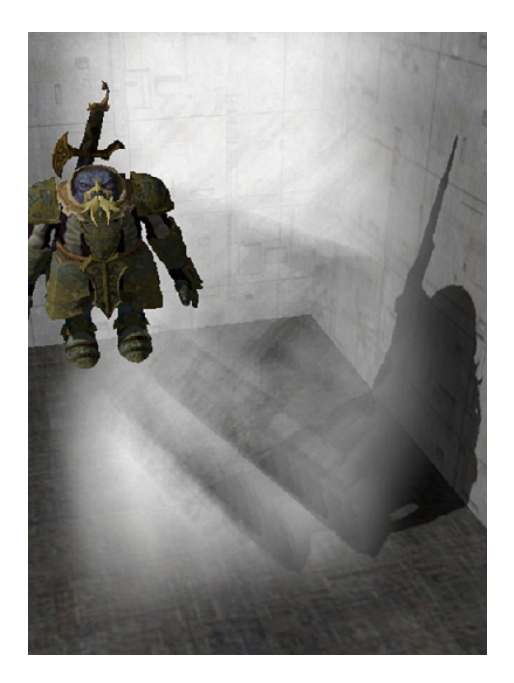
Figure 1: External shadows on a smoke particle system.

particle-based solution, which is the approach that we have selected for our work.