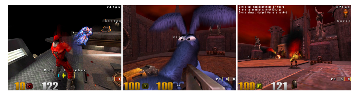
Figure 2: Student hand-ins of 2005. Left to right: Motion blur (using render-to-texture), Fur shader (using a pixel shader), Burning player models (particle effect).

As a result, most students do much more work voluntarily than required for the lecture. Even though we emphasize that a simple 3D effect is enough to get a high grade, many students invest hundreds of hours into programming their assignments. Figure 1, Figure 2 and Figure 3 show results of the work these highly motivated students. It is also noteworthy that the lab assignment can be concluded with a LAN game party with the objective of fragging the lecturer as much as possible.