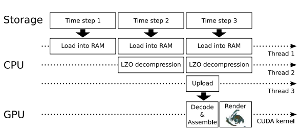
Figure 2: Our hybrid CPU/GPU decompression pipeline.

result so that the additional costs of supporting all possible numbers of bits are not justified.