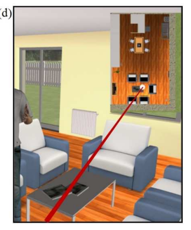
Figure 1. (a) User in the immersive environment. (b) Left: High anthropomorphic character, Right:Low anthropomorphic character. (c) Top: Exocentric point of view, Down: Egocentric point of view. (d) Ray to point on the 2D mini-map to displace the character