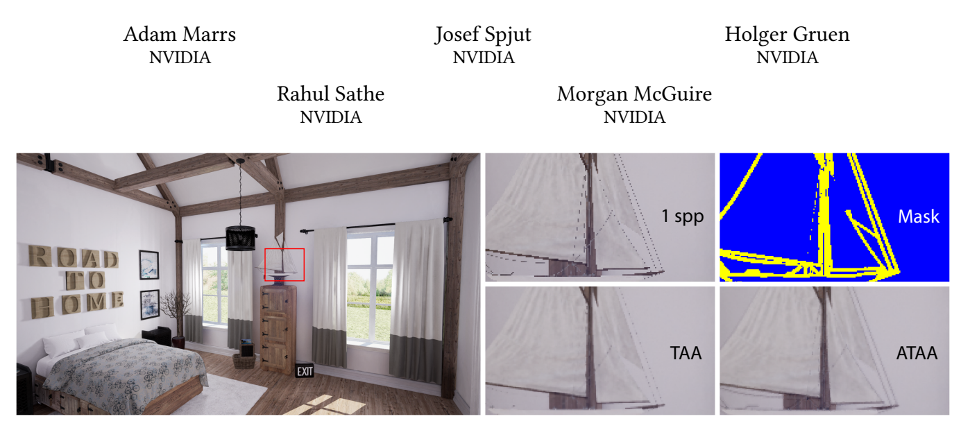
Figure 1: A modern house scene in Unreal Engine 4 with deferred shading, ray traced shadows, our adaptive temporal antialiasing technique, and a moving camera at 30 fps on NVIDIA Titan V. Zoomed details show raw 1 sample per pixel raster input, standard TAA output, a visualization of our segmentation mask, and our ATAA 8x result.